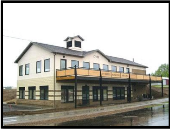
AIRPORT ADMINISTRATION BUILDING